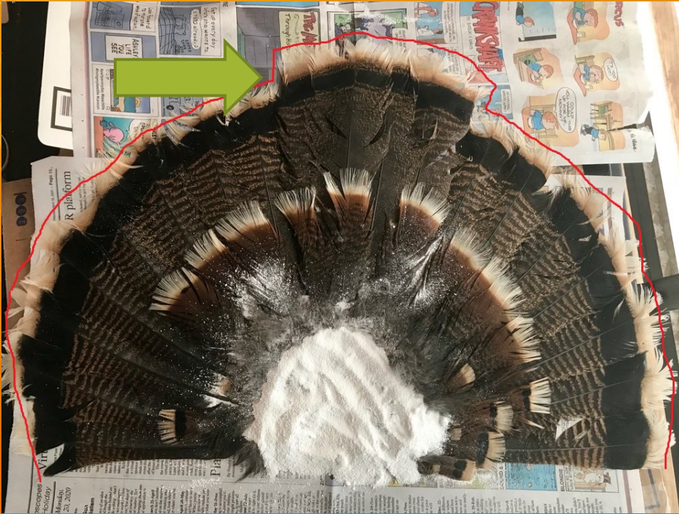
Above: Jake gobbler tail fan. Notice how middle feathers are taller than rest of fan feathers on the jake. On mature gobblers all fan feathers are same height.