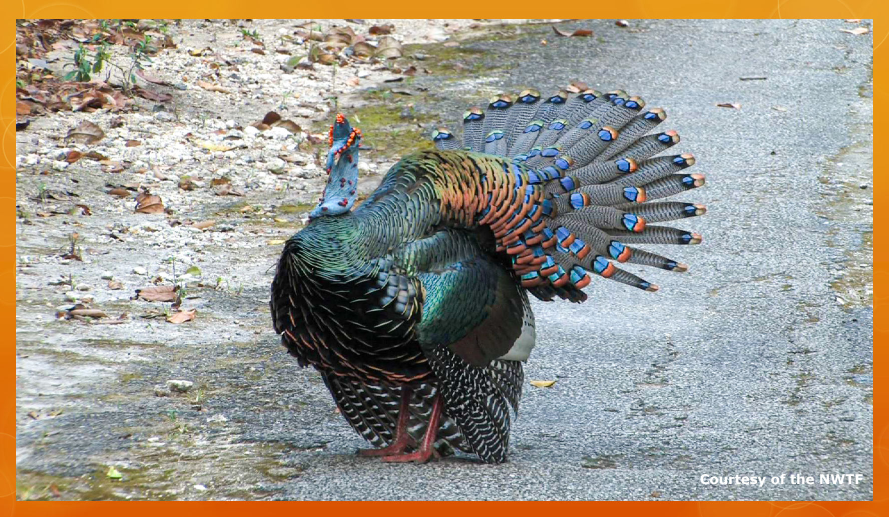
Found in Campeche, Mexico and Guatemala.