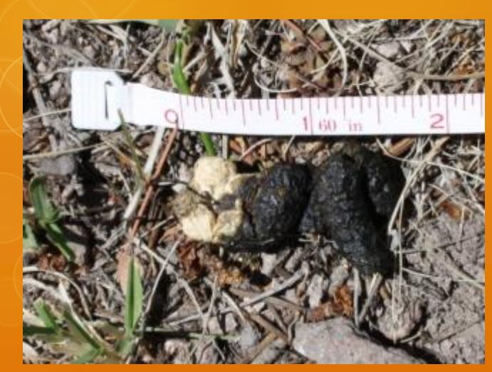
Top: Hen dropping with it's classic spiraled appearance

Right: Hen track which is smaller than gobbler. Hens will weigh about 10-12 lbs. and gobblers will weigh 18-25 lbs (depending on subspecies). Gould's can weigh more.