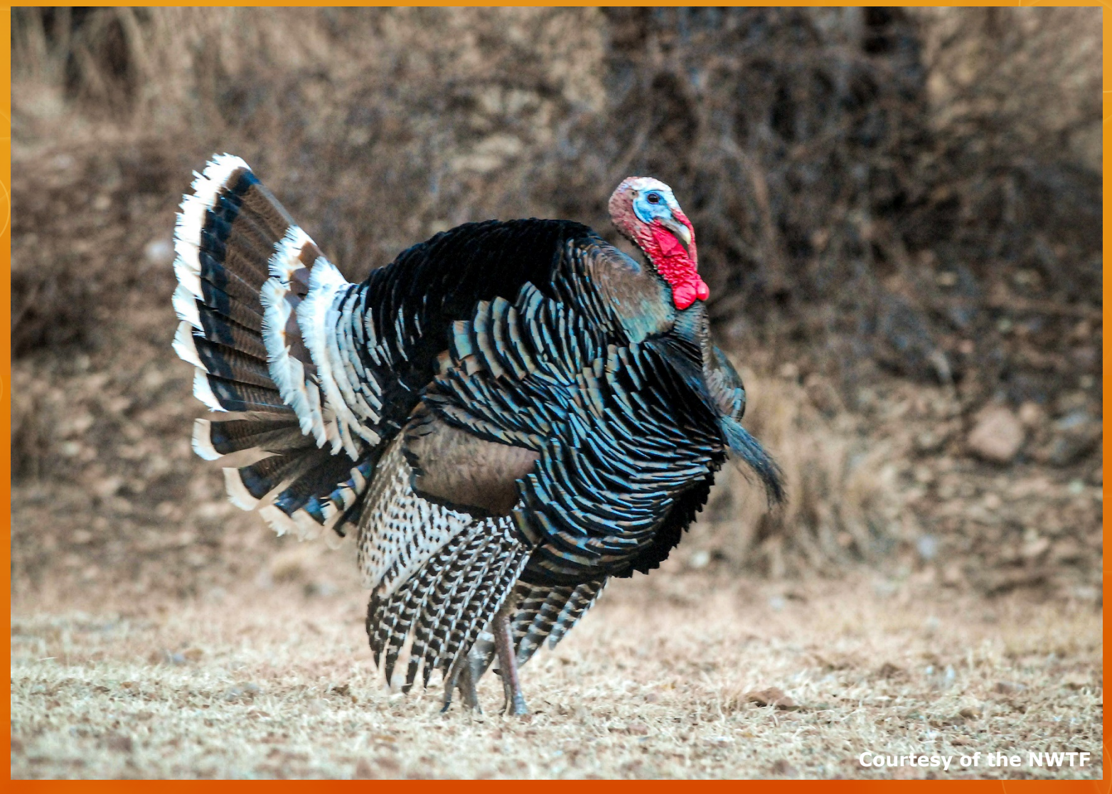
Have white tips on tail fan. Found in southwest part of N.M., southeast part of A.Z. and Mexico.