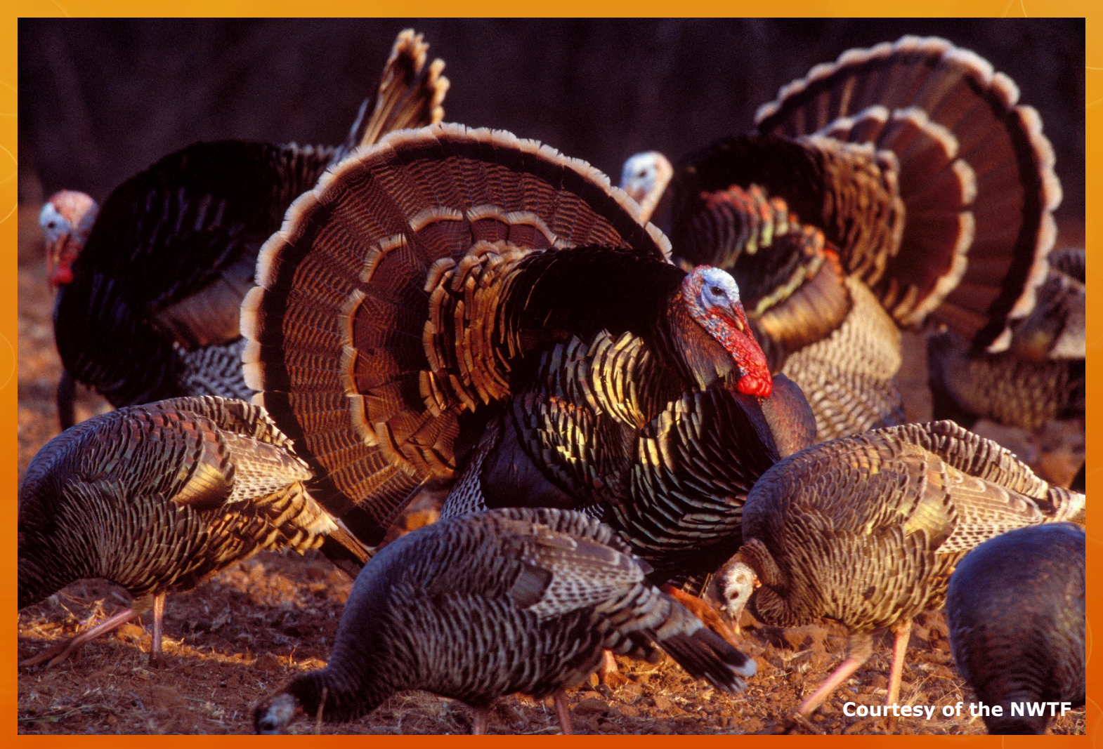
Tail fan has tan on tips of feathers. Predominantly found in Central Plains states.