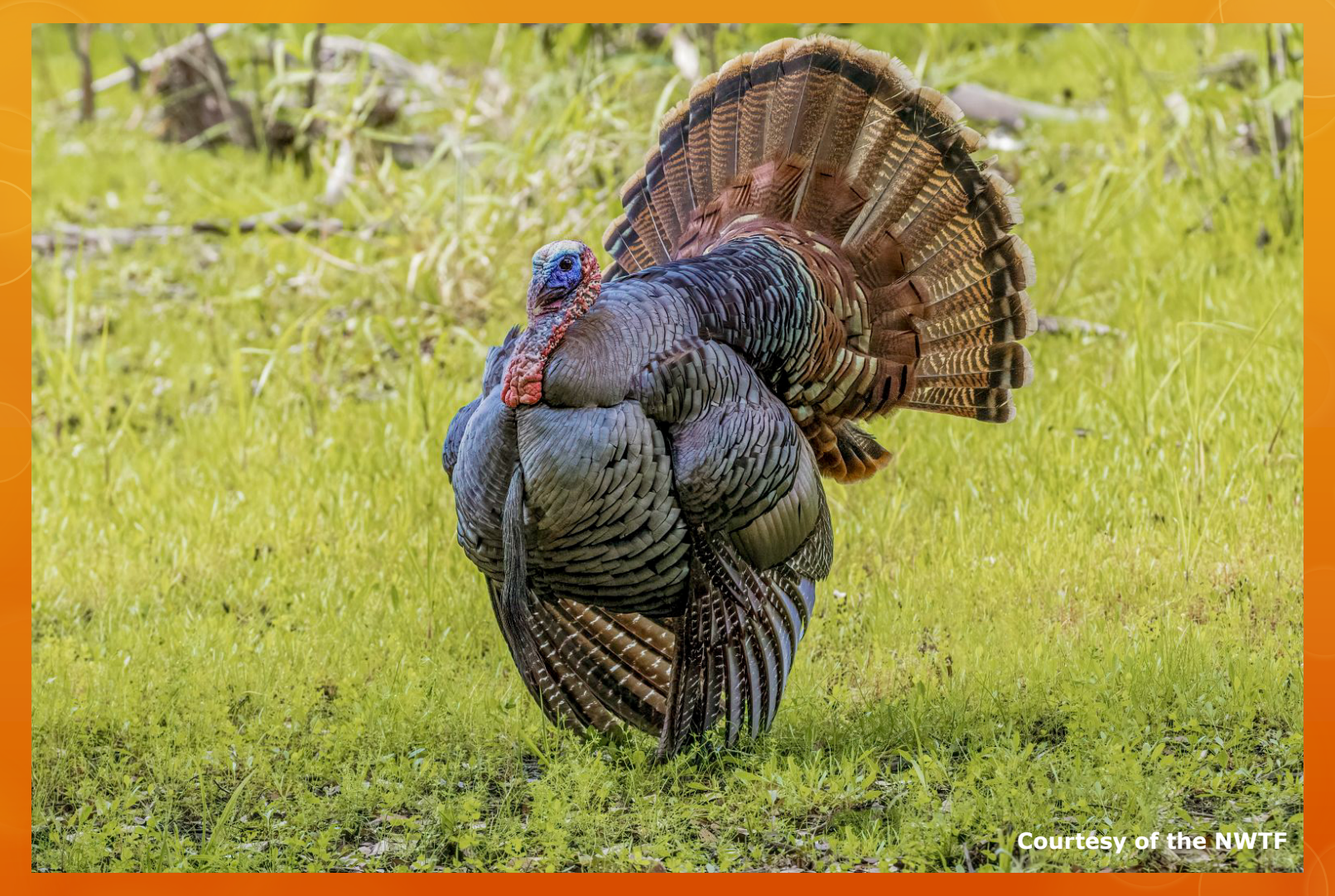
Found in peninsula of Florida.