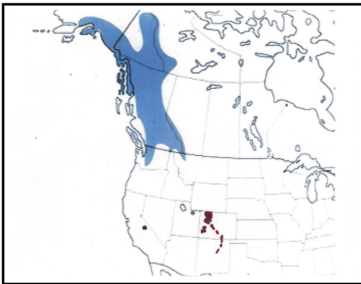
Figure 1. Global distribution of white-tailed ptarmigan. Southern subspecies ( Lagopus leucura altipetens ) distribution is shown in red. Black dots (California and Utah) denote extant introduced populations outside the historical range of the species. (Adapted from Martin et al, 2015; permission from Clait Braun).

Global : The white-tailed ptarmigan is endemic to alpine habitats in western North America and is the only species of ptarmigan whose range extends south of Canada. It occurs exclusively in North America, occupying alpine habitats from the central Yukon and southeast Alaska south through the mountain cordillera of British Columbia and western Alberta, and into northwestern Montana and the Cascade Range in Washington (Figure 1). It is distributed discontinuously through the U.S. Rocky Mountains south of Montana into New Mexico; no extant populations are currently known in Wyoming.