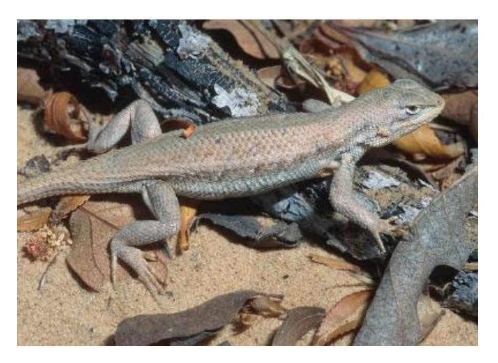
State endangered dunes sagebrush lizard (Sceloporus arenicolus).

To reduce costs and maximize effectiveness of employing a biological monitor, concurrent trenching and backfilling should occur, minimizing the amount of open trench at any time. During daily and longer shut-down periods, open trench between trenching and back-filling operations should be protected using one or more of the methods described above.