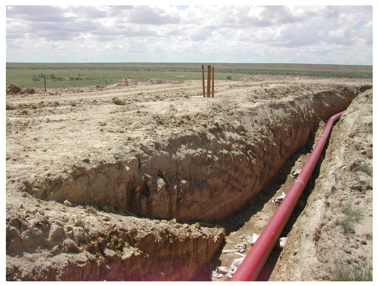
Escape ramps allow trapped wildlife to leave the trench.