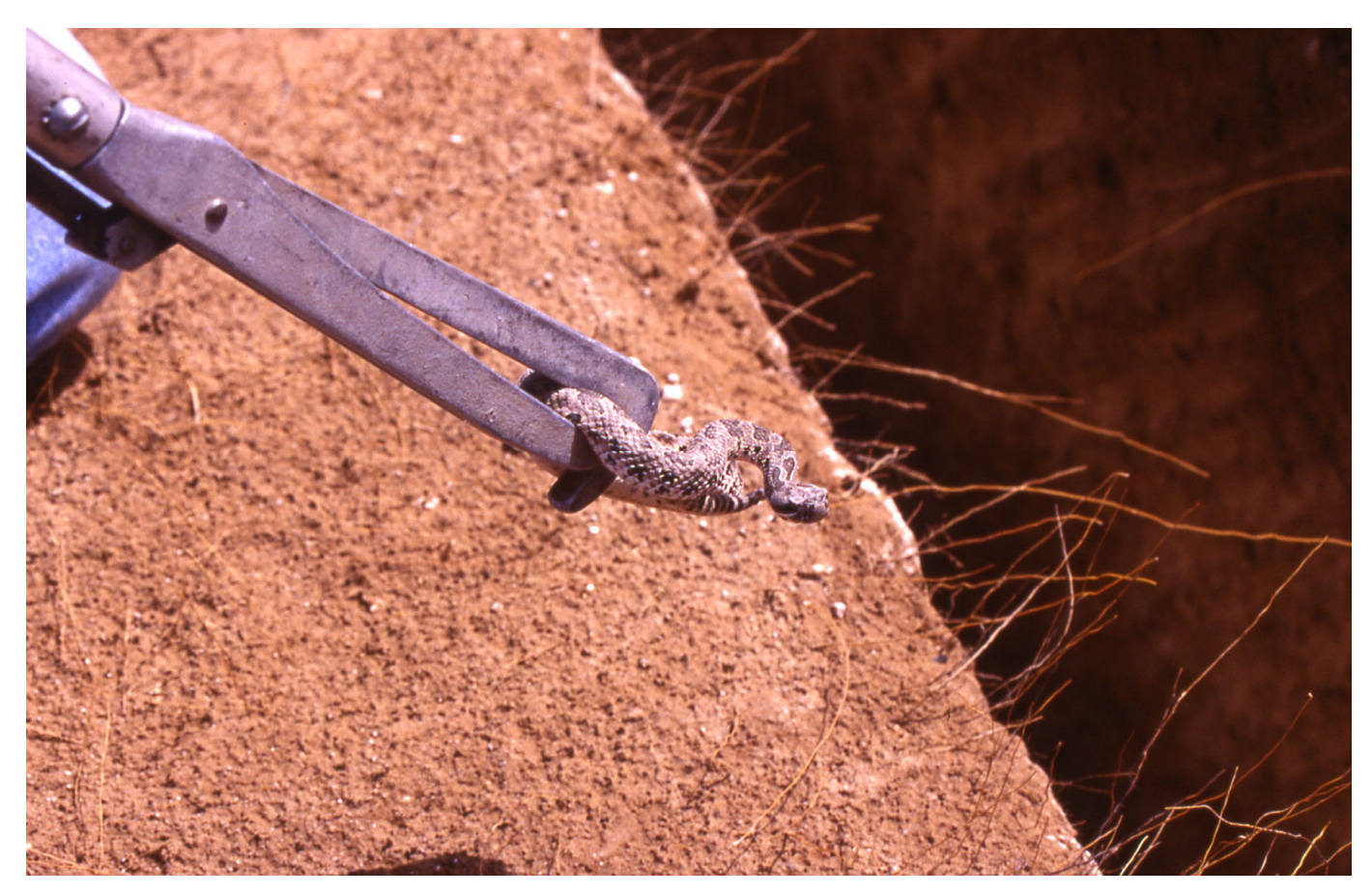
Western massasauga rattlesnake (Sistrurus tergeminus) removed from open trench.

There are also examples of wildlife being trapped in trenches from New Mexico. In 2001, in Bernalillo County, New Mexico, a fiber optic cable trench approximately 4.8 kilometer-long, 0.25 meter wide, and 1.8 meters deep was documented to have trapped 298 individual reptiles and amphibians (see photos above and below). Two species of toads, 5 species of lizards, and 9 species of snakes were removed from the trench, including 105 glossy snakes ( Arizona elegans ), 41 plains black-headed snakes ( Tantilla nigriceps ), and 68 western massasauga rattlesnakes ( Sistrurus tergiminus ). Since no escape ramps were constructed for the trench and no biological monitor was employed to remove trapped animals, all of these animals would have died had they not been removed by Department biologists and concerned citizens. This would have represented unnecessary wildlife mortality, and the endangerment of these animals could have been avoided with better planning efforts. Furthermore, in 2010 in the Mescalero-Monahans shinnery sands ecosystem of southeastern New Mexico, Romano et al. (2014) surveyed portions of a 65 kilometer-long oil pipeline trench from an area south of Maljamar to Artesia. The trench measured 1.5 meters deep and 0.7 meter wide. A total of 24 individuals of 10 vertebrate species (reptiles, amphibians, and small mammals) were removed from the trench, of which four were found dead. Ecological effects of such events are unknown but may adversely affect local populations.