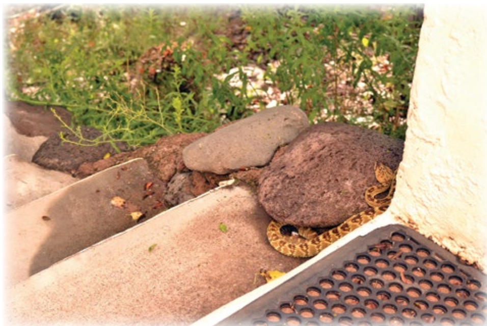
Porter, female Western Black-tailed Rattlesnake ( Crotalus molossus ), hunts against a rock alongside a human walking path.