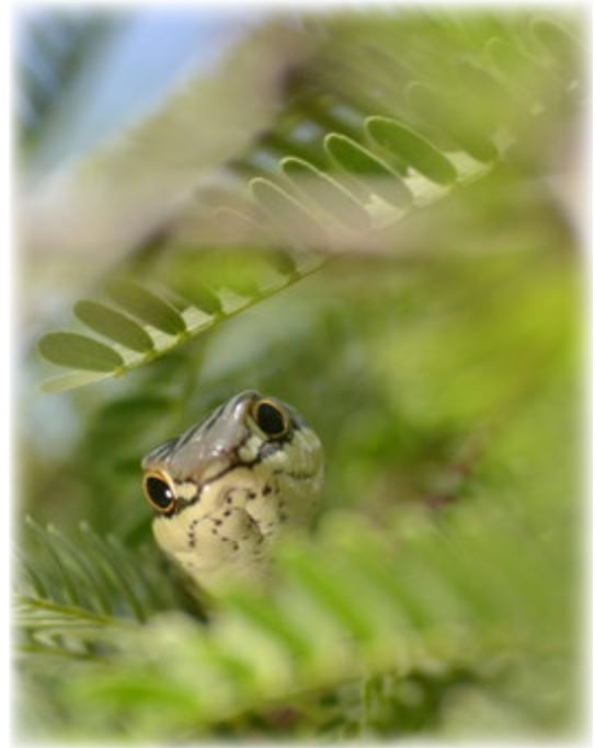
A curious Sonoran Whipsnake ( Coluber bilineatus ) peers at the photographer from the branches of a Mesquite Tree.

The New Mexico Department of Game & Fish's Share with Wildlife Program awarded Advocates for Snake Preservation (ASP) $5,000 to fund a project entitled Snake Country Survival Guide: Safe, Sustainable Solutions to Human-Snake Conflicts . With these funds, ASP produced a video based on our Snake Country Survival Guide brochure and expanded our online resources to include a field guide, species list, and videos of cool snake behaviors to help people become familiar with their snake neighbors in New Mexico. An estimated 30,000 people are more likely to welcome their snake neighbors and appreciate, rather than fear, their encounters. If each person has just one positive, rather than negative, interaction with a snake, that's 30,000 snakes that avoided persecution! Our positive impact is likely much greater, as people often share what they've learned from us with their friends and neighbors.