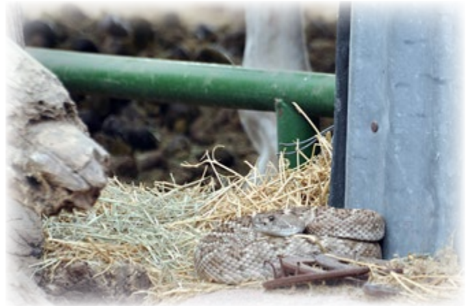
Stuart, Western Diamond-backed Rattlesnake ( Crotalus atrox ), hunting next to a barn with a horse standing nearby. Rattlesnakes are very effective predators of small mammals that consume horse feed, often stored in barns.

Our Snake Country Survival Guide video answers the most common question we get: What do I do about snakes in my yard? In it, we discuss: