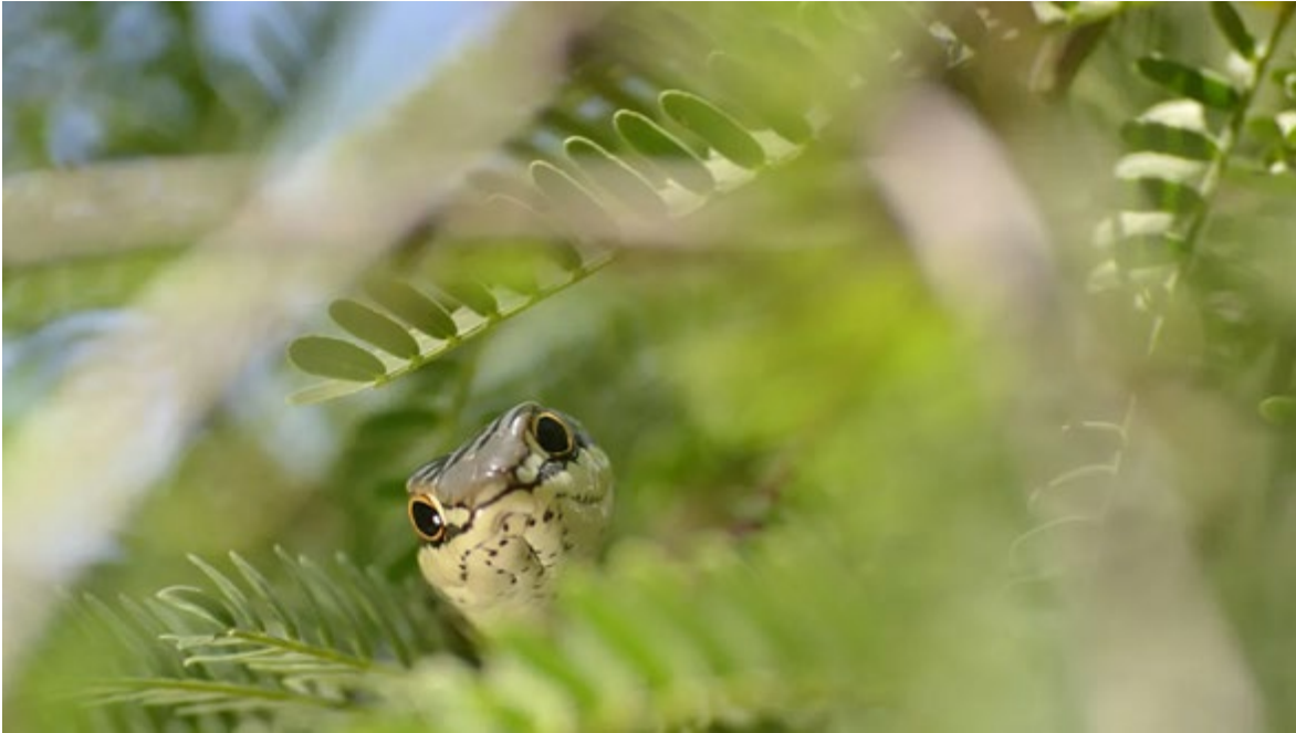
Sonoran Whipsnake ( Coluber bilineatus ) peeking at us from within the leaves of a Mesquite Tree.