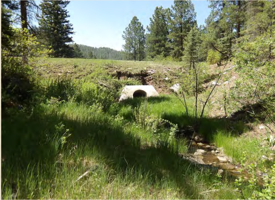
Rito Peñas Negras AOP