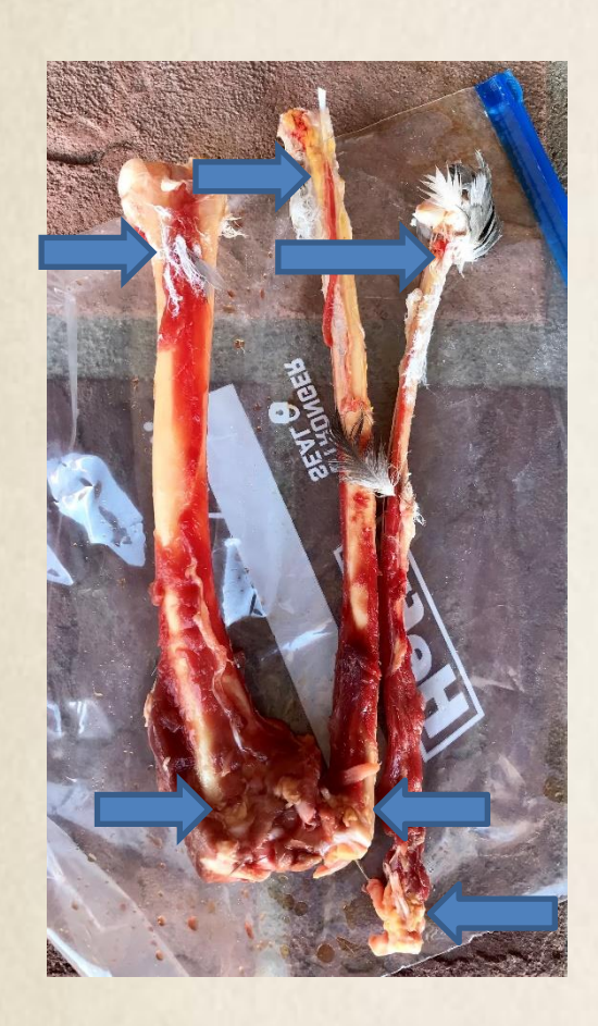
Blue arrows represent approximate areas to cut the leg bones.