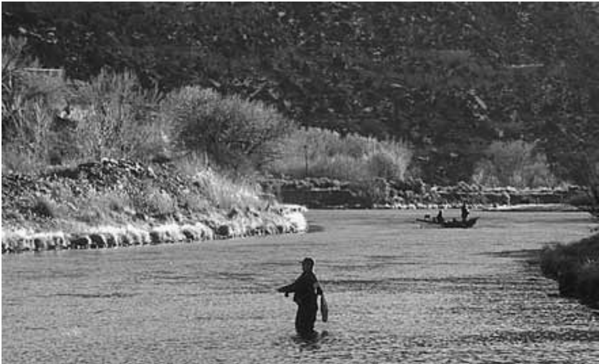
Anglers enjoying late afternoon fishing on the San Juan River