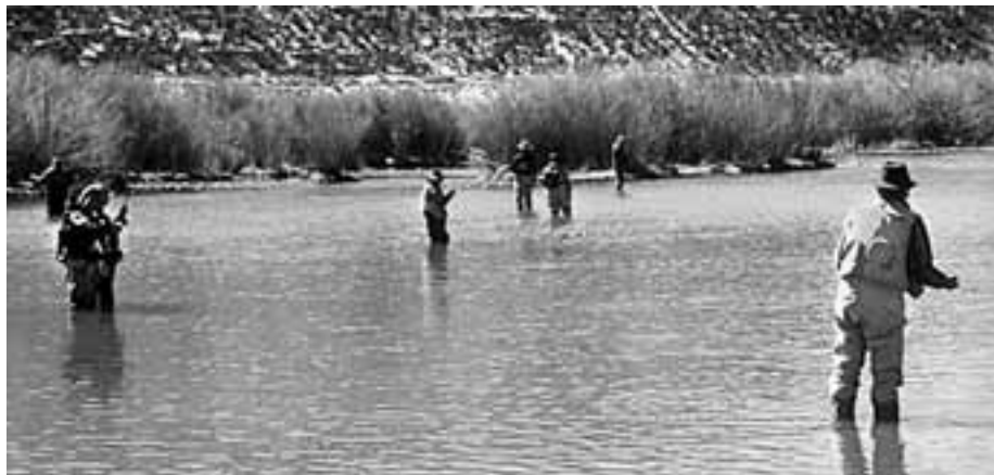
Heavy fishing pressure exists in some reaches

Possible explanations for the decline in the average size of rainbow trout in the Special Trout Water include over-harvesting of large fish, increasing angler densities, flow modifications, diminished food resources, and increasing fish densities.