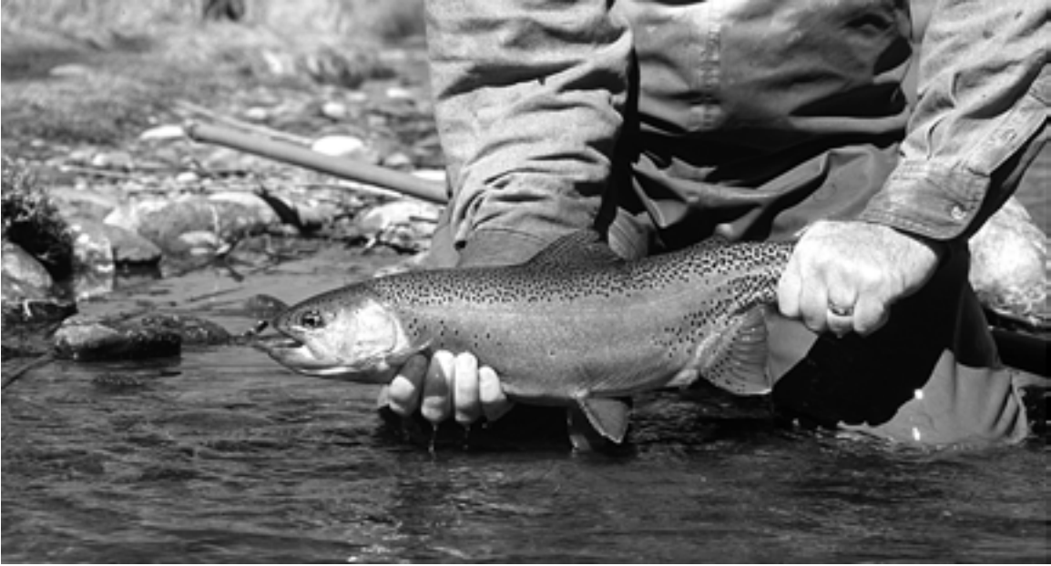
A nice San Juan River rainbow trout

Rainbow trout usually begin spawning at 2-4 years of age. The age of sexual maturity can vary greatly depending on environment, size, and genetics (Behnke 1992). Rainbow trout that have good instream habitat and productive food sources will usually have a large body size at an early age, and therefore spawn earlier than a fish that inhabits a less productive aquatic environment. Mature females produce 1,200 to 3,200 eggs per kilogram of body weight.