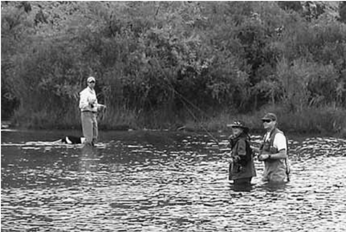
Fishing guide helping a client

The fish population in the Special Trout Water has remained fairly constant from 1993-2003 as measured by angler catch rates and annual population surveys conducted by NMDGF. Data from catch rate and collection surveys help monitor numbers and size of fish in the Special Trout Water. Angler catch rates have been stable and quite high, averaging 1.12 fish/hr over the past 10 years, reflecting a very large fish population (Wethington 2002). Annual electrofishing surveys during the same period of time have consistently reported high catch rates, also reflecting a large fish population.