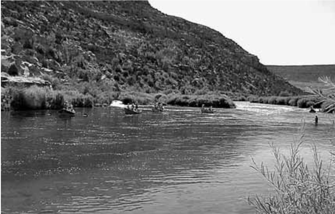
Many anglers fish from guide boats in the Special Trout Water

data, on average, an estimated 250,000 trout are landed each year meaning that many of the same fish are landed several times per year. With anglers handling 250,000 fish a year in a catch-and-release fishery, angler-induced mortality becomes a primary concern in the Special Trout Water.