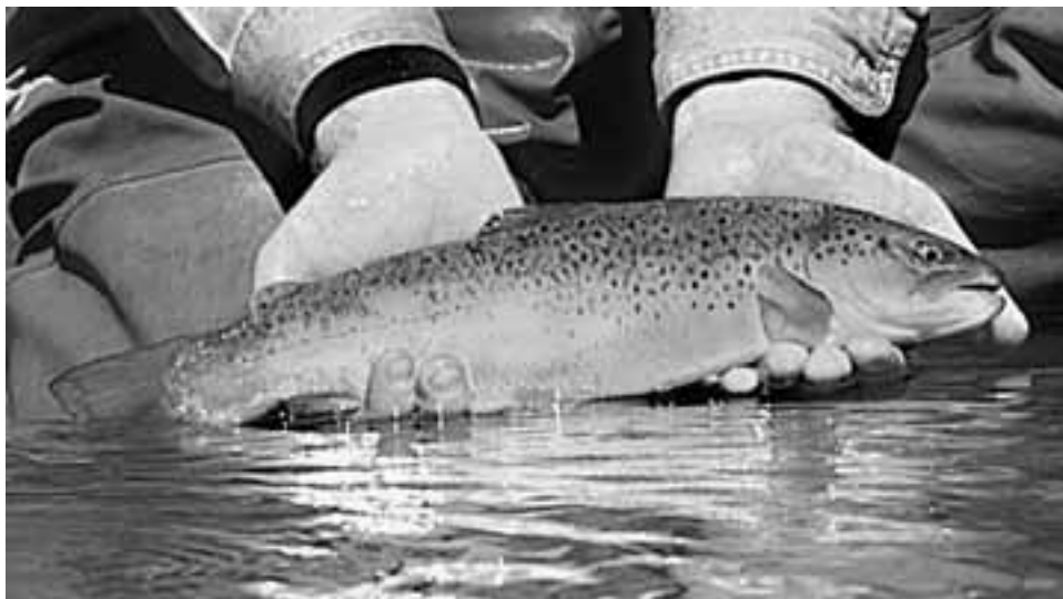
Brown trout are increasingly common in the Special Trout Water

Brown trout can survive a range of water conditions. The upper incipient lethal temperature for adults is approximately 27 C; optimal temperature for growth and survival is 12 C to 19 C (Raleigh et al. 1986). Optimal dissolved oxygen levels appear to be at least 9 ppm at temperatures less than or equal to 10 C, and at least 12 ppm at temperatures greater than 10 C (Raleigh et al. 1986). Incipient lethal dissolved oxygen concentration for adults is approximately 3 ppm (Burdick et al. 1954; Doudoroff and Shumway 1970). Brown trout tolerate a range in pH of 5.0-9.5 (Raleigh et al. 1986), although optimal growth occurs at a pH of 6.8-7.8 (Heacox 1974).