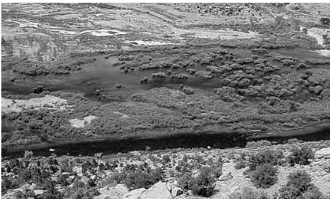
Aerial view illustrating different river channel types.