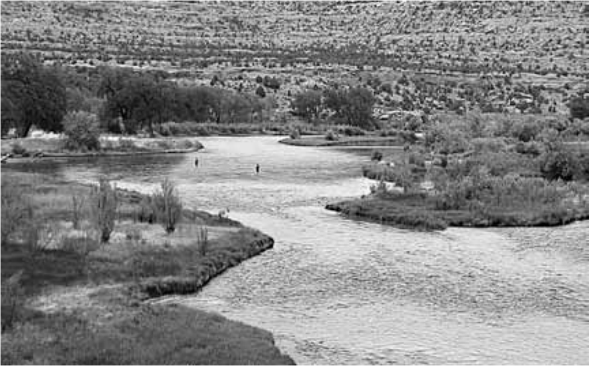
Regular Regulation Water lies downstream from the Special Trout Water