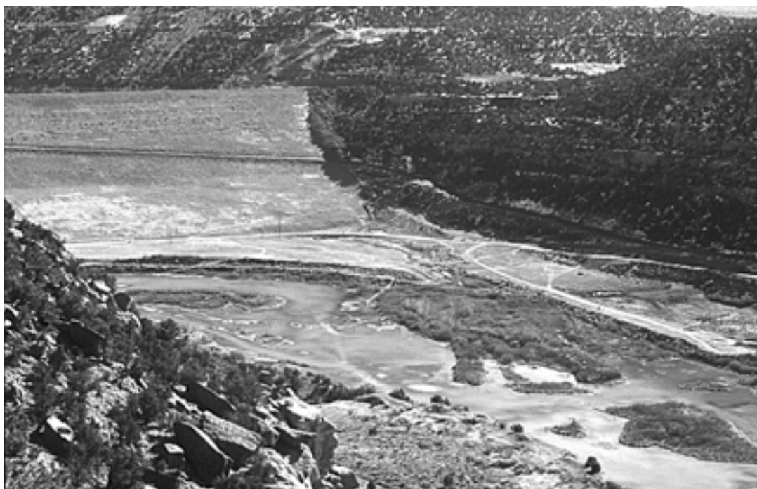
Navajo Dam and the beginning of the San Juan River Special Trout Water