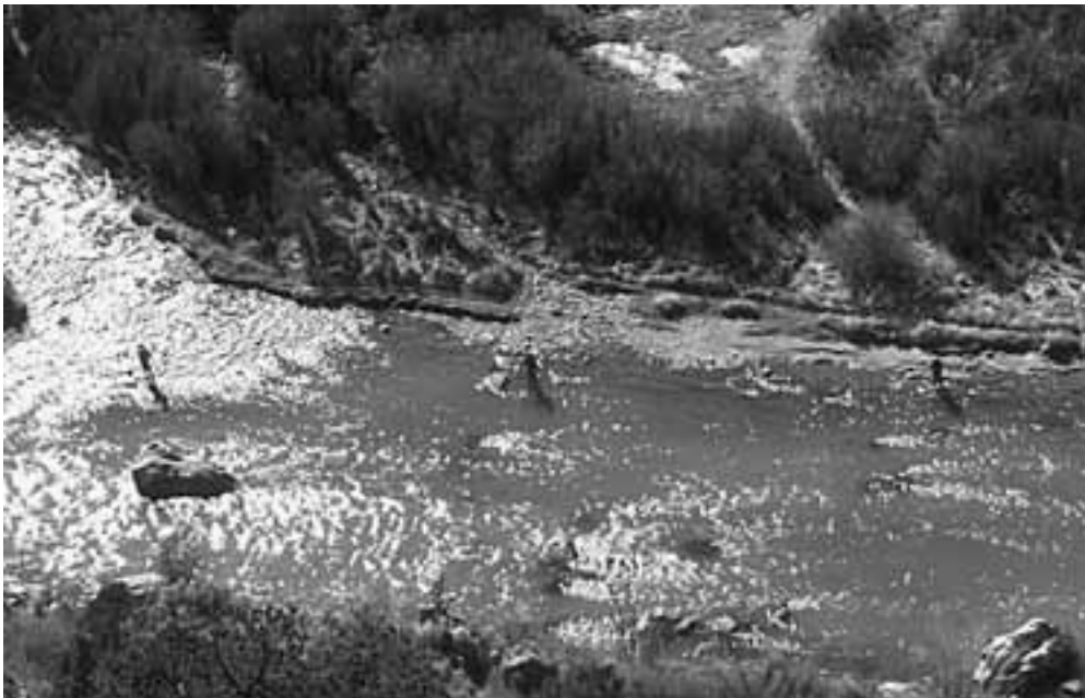
The San Juan River provides excellent fishing opportunities in numerous back channels.

Angler use in the Special Trout Water has remained high from 1990 to 2001, with a record high 243,842 angler hours recorded in 1999. Catch rates in the Special Trout Water have remained high during the past five years (1998-2002), with an average of 1.12 fish/hour or 273,000 fish landed annually. Harvest rates in the Special Trout Water are extremely low because most anglers practice catch-and-release fishing. Less than 1 percent of all the anglers surveyed had harvested a fish, but the high demands on the fishery are still apparent with approximately 90 percent of the fish collected in surveys showing signs of hooking scars in the Special Trout Water.