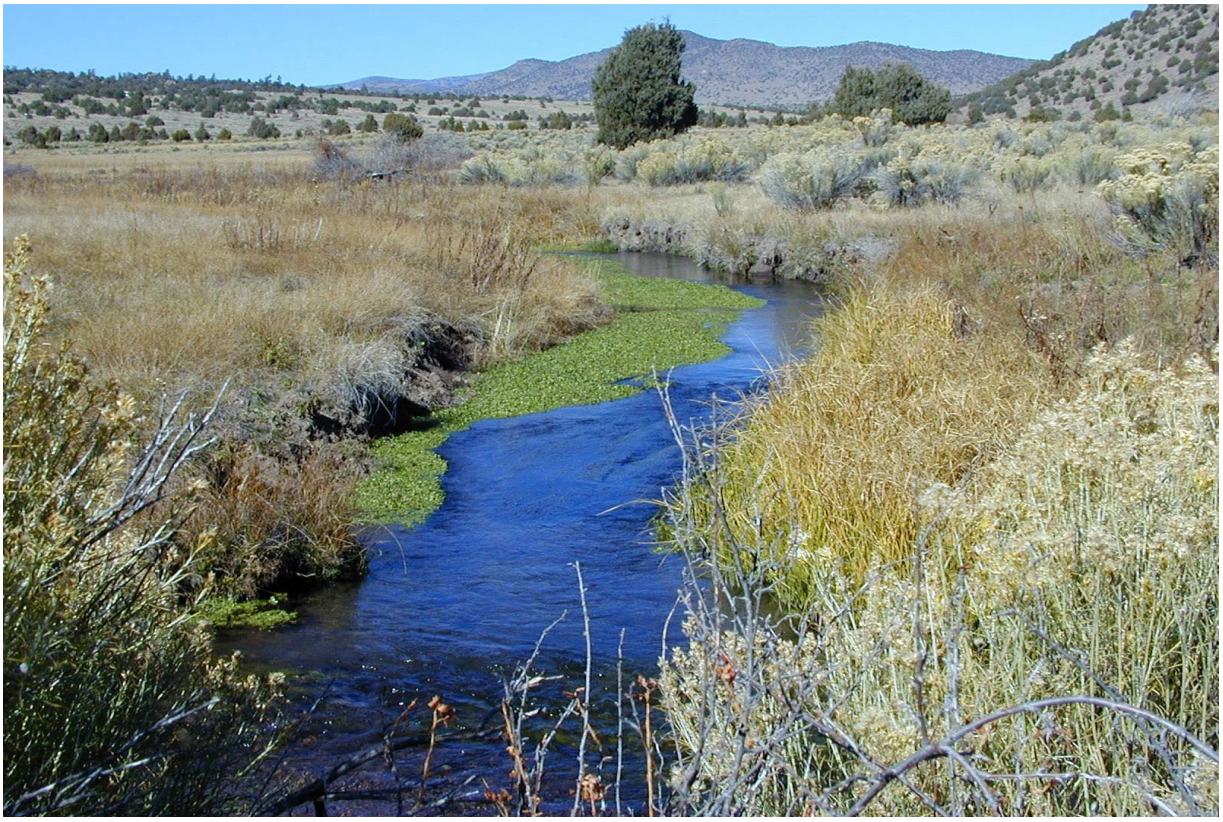
Figure 2. Rio Grande Sucker habitat, Hot Creek, Colorado.

The deposition of fine sediments appears to have a negative effect on RGS abundance and condition (Swift-Miller et al. 1999a). Rio Grande Sucker occupied habitats with total percent of fine substrates (< 2mm) ranging from 4.5–38%, but condition was negatively related to the proportion of fine sediment (Swift-Miller et al. 1999a). Similarly, the amount of sand/silt substrate was inversely related to fish density in each habitat unit in Hot Creek (Swift-Miller et al. 1999b). The mechanism for this relationship is not well understood. It is possible that RGS prefer larger substrate because coarser materials provide for algal growth and macroinvertebrate production (Calamusso 1996), which comprise the majority of their diet (Zuckerman and Langlois 1990, Swift-Miller et al. 1999a).