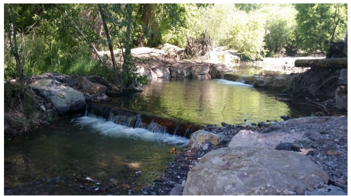
Figure 3. Recently restored Rio Grande Sucker habitat on the Mimbres River, New Mexico.