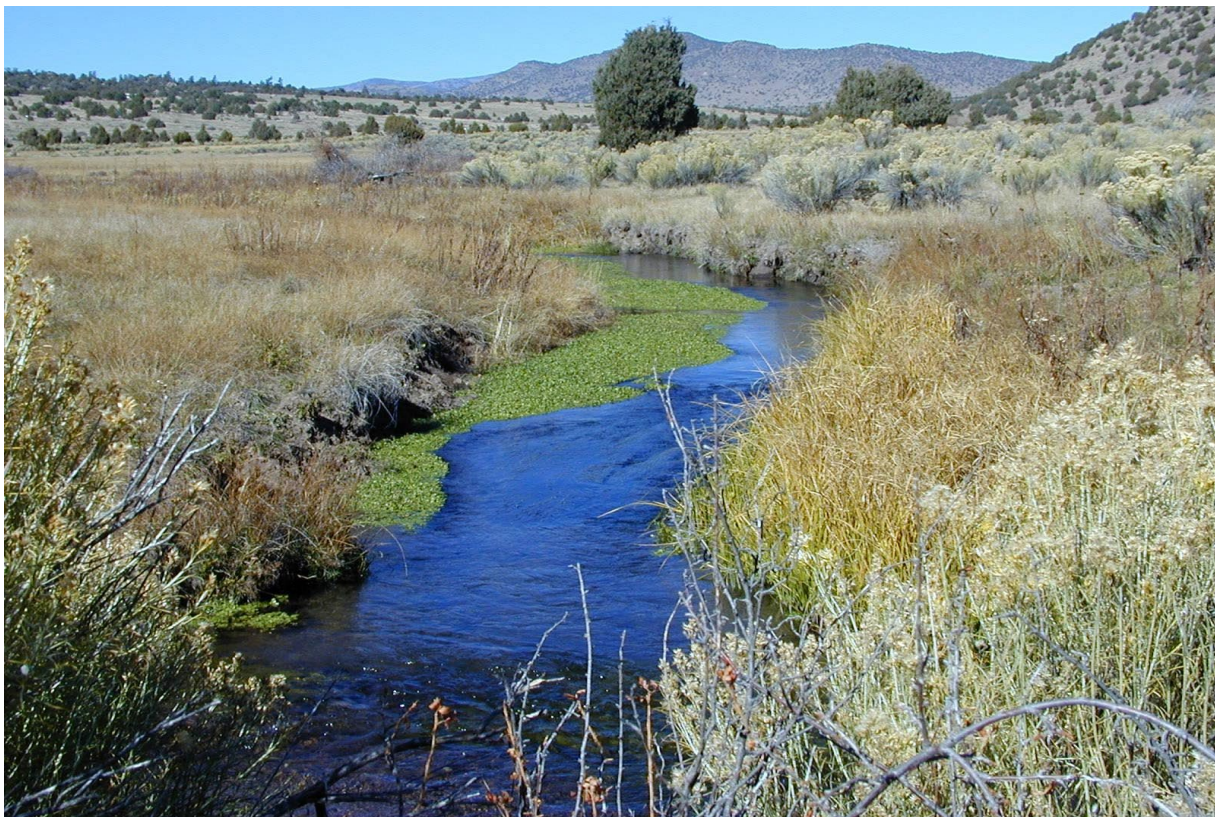
Figure 2. Rio Grande Sucker habitat, Hot Creek, Colorado.

The deposition of fine sediments appears to have a negative effect on RGS abundance and condition (Swift-Miller et al. 1999a). Rio Grande Sucker occupied habitats with total percent of fine substrates (< 2mm) ranging from 4.5–38%, but condition was negatively related to the proportion of fine sediment (Swift-Miller et al. 1999a). Similarly, the amount of sand/silt substrate was inversely related to fish density in each habitat unit in Hot Creek (Swift-Miller et al. 1999b). The mechanism for this relationship is not well understood. It is possible that RGS prefer larger substrate because coarser materials provide for algal growth and macroinvertebrate production (Calamusso 1996), which comprise the majority of their diet (Zuckerman and Langlois 1990, Swift-Miller et al. 1999a).