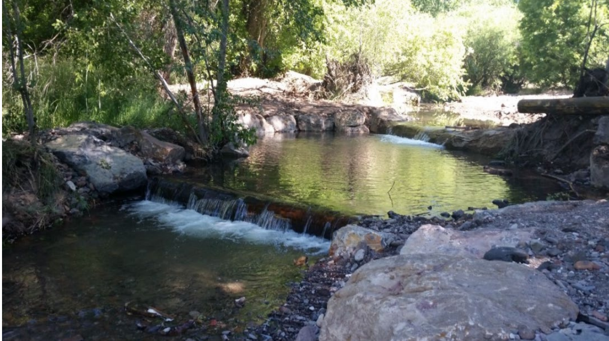
Figure 3. Recently restored Rio Grande Sucker habitat on the Mimbres River, New Mexico.