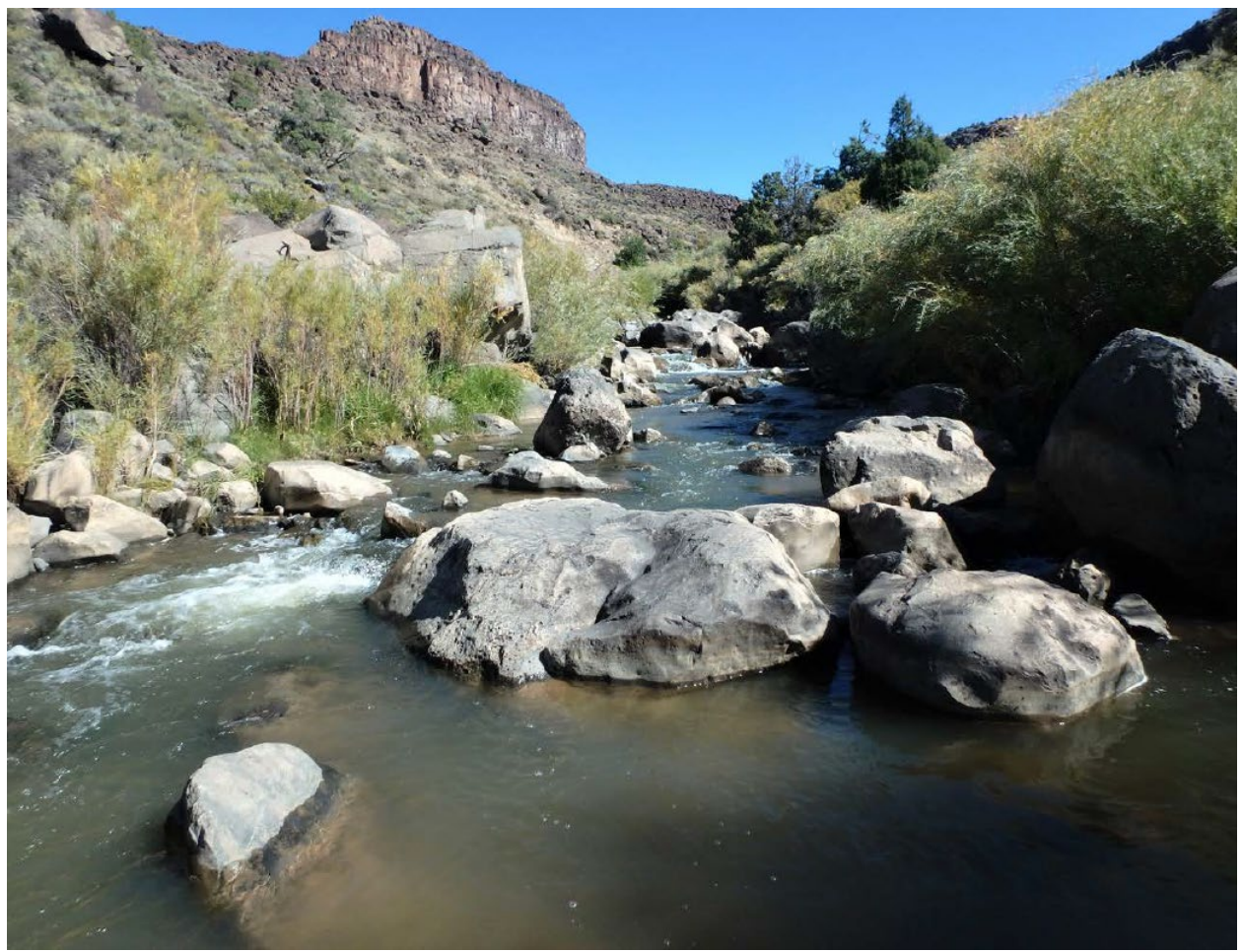
Figure 3. Rio Grande Chub habitat, Rio Pueblo de Taos, New Mexico.