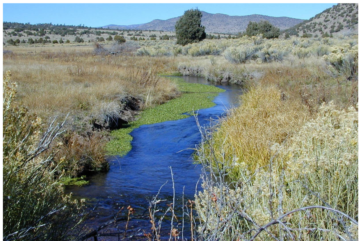
Figure 2. Rio Grande Chub habitat, Hot Creek, Colorado.