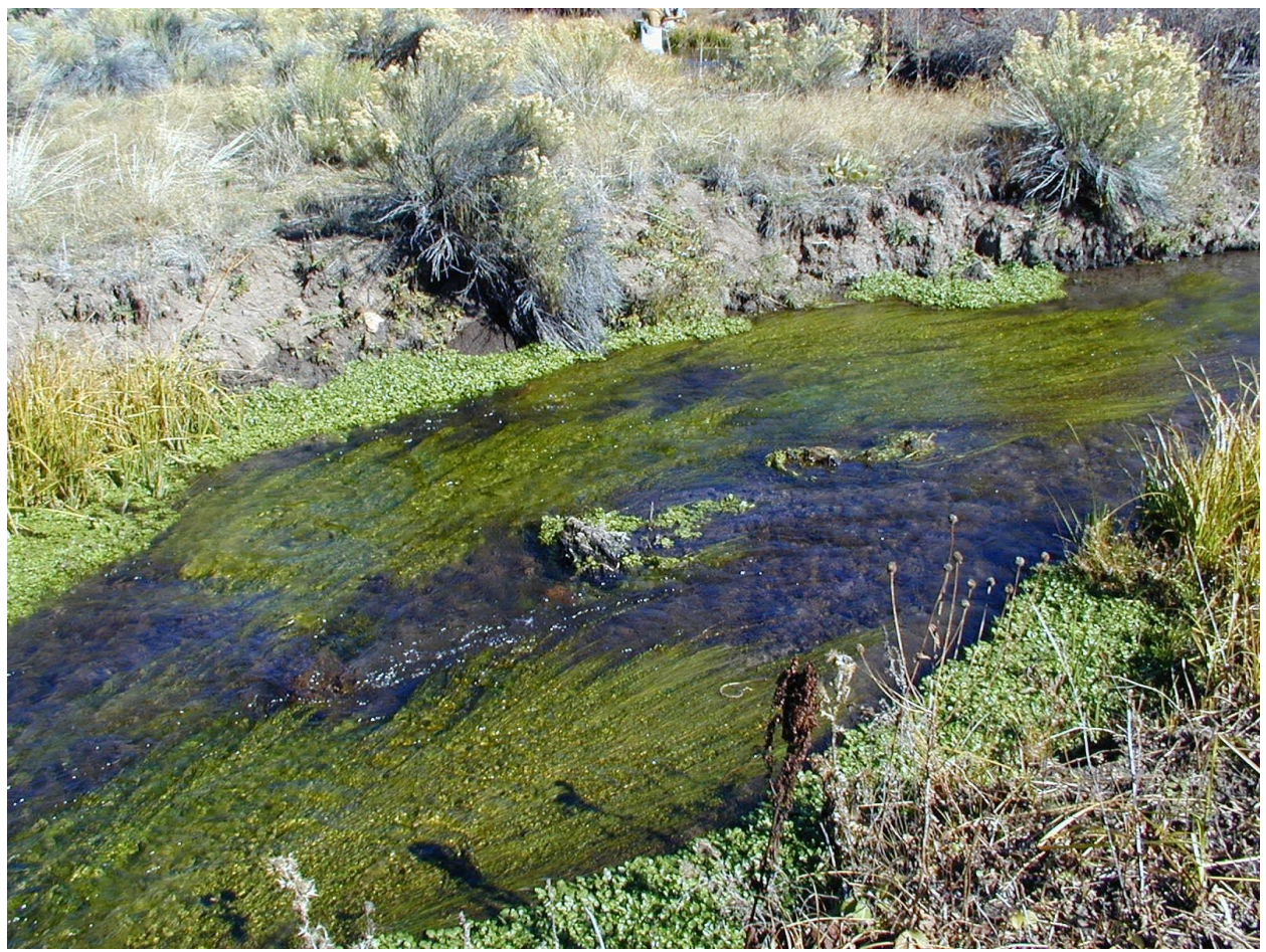
Figure 4. Aquatic vegetation such as Nasturtium and Potamogeton spp. provided instream cover for Rio Grande Chub.