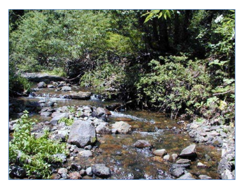
Figure 2. Rio Grande cutthroat trout habitat, Wolf Creek, Colorado.

Most cutthroat trout are opportunistic feeders, eating both aquatic invertebrates and terrestrial insects that fall into the water (Sublette et al. 1990). Other subspecies of cutthroat trout become more piscivorous (fish eating) as they mature (Moyle 1976; Sublette et al. 1990) and cutthroat trout living in lakes will prey heavily on other species of fish (Echo 1954). It is possible that native cyprinids (i.e., chubs, minnows, and dace) and suckers were once important prey items for Rio Grande cutthroat trout; for example, predation of Rio Grande sucker by Rio Grande cutthroat trout has been observed in Medano Creek in Great Sand Dunes National Park in Colorado (F. Bunch, Great Sand Dunes National Park, pers. comm.). Growth of cutthroat trout varies with water temperature and availability of food.