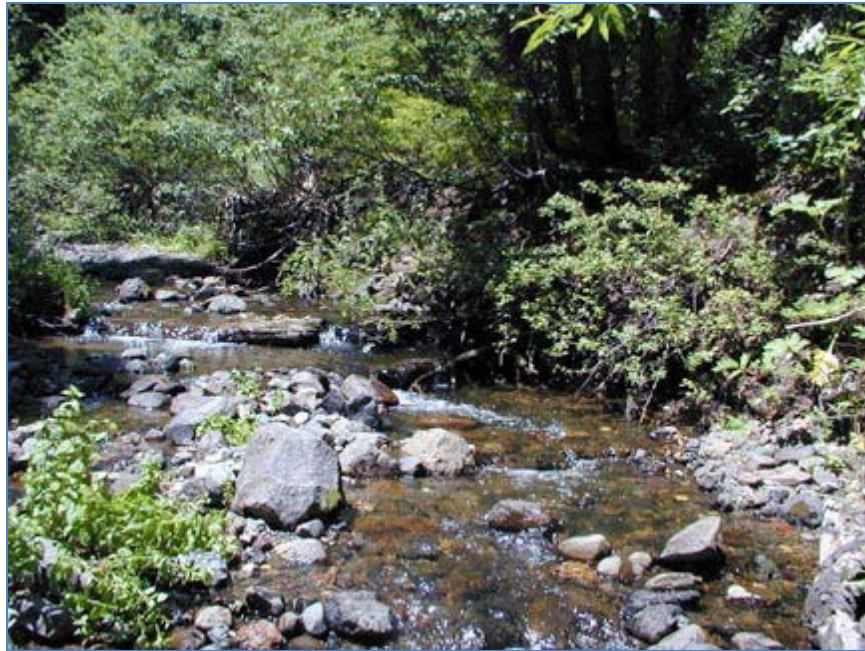
Figure 2. Rio Grande cutthroat trout habitat, Wolf Creek, Colorado.

Most cutthroat trout are opportunistic feeders, eating both aquatic invertebrates and terrestrial insects that fall into the water (Sublette et al. 1990). Other subspecies of cutthroat trout become more piscivorous (fish eating) as they mature (Moyle 1976; Sublette et al. 1990) and cutthroat trout living in lakes will prey heavily on other species of fish (Echo 1954). It is possible that native cyprinids (i.e., chubs, minnows, and dace) and suckers were once important prey items for Rio Grande cutthroat trout; for example, predation of Rio Grande sucker by Rio Grande cutthroat trout has been observed in Medano Creek in Great Sand Dunes National Park in Colorado (F. Bunch, Great Sand Dunes National Park, pers. comm.). Growth of cutthroat trout varies with water temperature and availability of food.