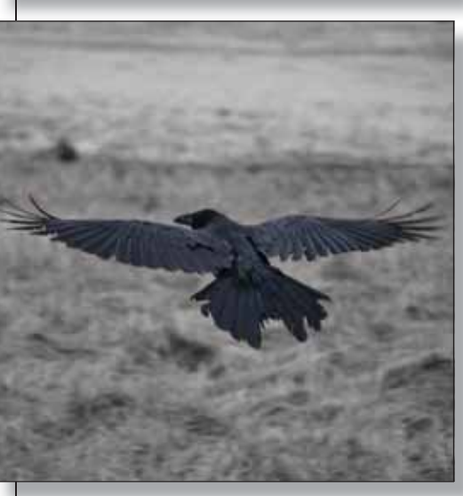
TOP: Chihuahuan Raven showing white at base of neck feathers .LOWER: Common Raven wings are long and pointed and the tail wedge-shaped.

and quick flyers. They will cache surplus food in between rocks or crevices, or hide it under leaves or debris. They will also carry off shiny objects totally unfit for food and will stash them in their nests.