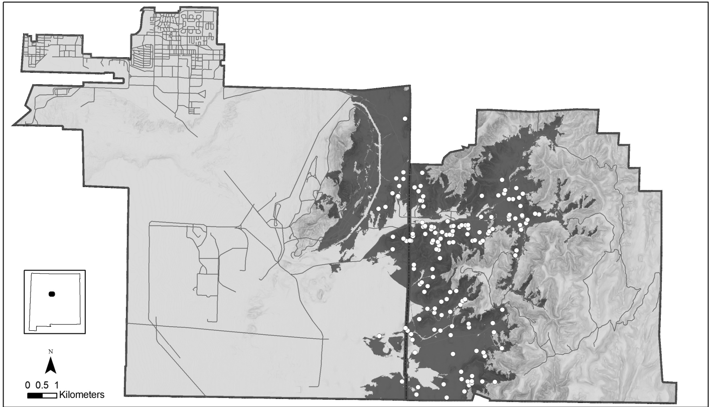
FIGURE 1. Potential Gray Vireo ( Vireo vicinior ) habitat on Kirtland Air Force Base, New Mexico shown in black. White circles are use sites.

Tracks Training Site, where we have seven years of Gray Vireo monitoring data, we quantified solar radiation over the time of nest establishment and used these data as indicator metrics. These metrics correlate well with attempted nesting (Fig. 2). We hope to use these metrics, together with tree species metrics, to test nest location data across New Mexico. Also, protocols for measuring solar radiation in the field are needed to understand what the model-derived metrics are explaining, other than demonstrating a positive correlation with known and currently unknown breeding sites and negative correlation with poor habitat.