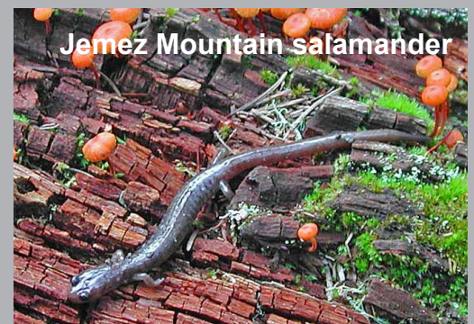
Jemez Mountain salamander