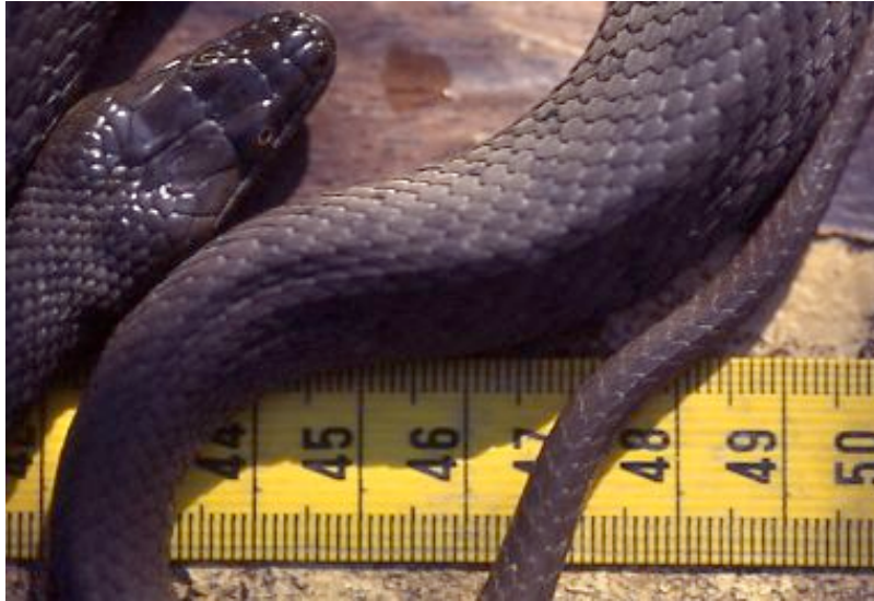
Figure 1. Narrow head of Narrow-headed Gartersnake, Catron County, NM.

The head of the aptly named Narrow-headed Gartersnake is longer than most garter snakes and the nose is laterally compressed with the eyes positioned high on the head (Ernst and Ernst 2003, Figure 1). The hemipenes of the species have not been described.