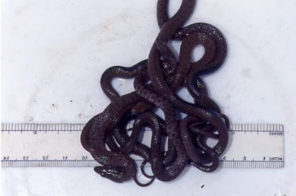
Figure 5. Narrow-headed Gartersnake neonates.

extirpated. Populations in Whitewater Creek appear to be healthy, with recruitment of young observed during 2006, although fewer were observed in 2007 (NMDGF files).