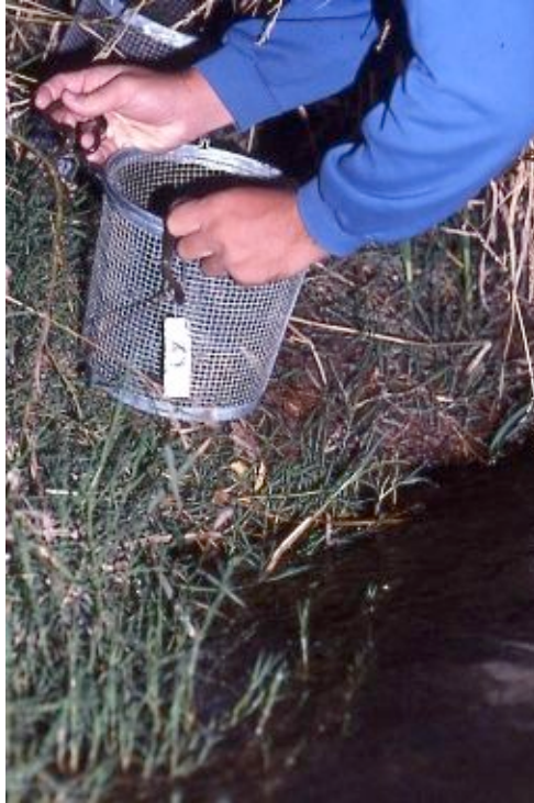
Figure 4. Microhabitat for the Narrow-headed Gartersnake, Catron County, NM. Shown is a minnow trap used by NMDGF for capture of the species.