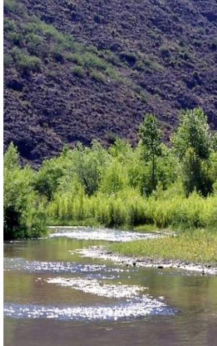
Figure 3. Stream habitat typical of Narrow-headed Gartersnake, Catron County, NM.

submerged under water (Rosen and Schwalbe 1988, Alfaro 2002, Hibbitts and Fitzgerald 2005, Nowak 2006, see Section 2.1.5, Food Habits).