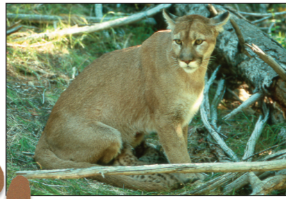
Cougar front and hind paw prints measure approximately 3 inches high.

Black bears commonly inhabit forested areas of New Mexico, but can be found from low-elevation desert to tundra areas above tree line. Bears prefer woodland cover and mixed forest with food-producing trees such as oak and piñon. Bears are attracted by water sources such as tanks, springs and creeks and may be attracted to mountain campgrounds or rural communities if human food sources are present.