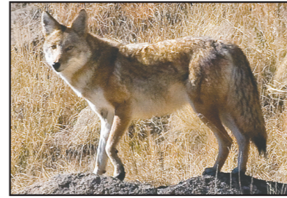
Coyote front paw prints measure approximately 2 1/2 inches high, and rear prints are slightly smaller.

Sometimes called mountain lions or pumas, cougars occupy all parts of New Mexico except the wide-open eastern plains. Cougars are found in piñon, juniper and ponderosa forest, mountain mahogany and desert, oak brush and subalpine meadows. Where prey are plentiful, cougars likely are nearby. An individual cougar's range can encompass 10 to approximately 300 square miles, depending on the terrain and available food. Their ability to feed on a wide variety of prey allows them to occupy many different habitat types. Females with young have smaller ranges and adult males the largest.