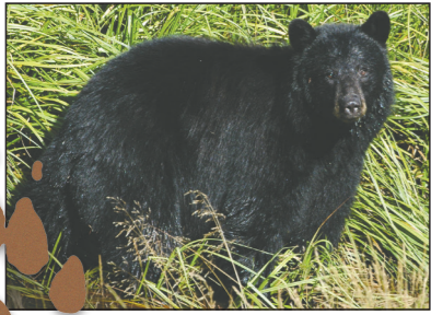
Front paw prints of black bears typically measure 4 1/2 inches high. Hind prints can measure up to 7 1/2 inches high.