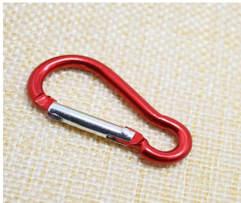
Illustration # 1 – Key Ring Carabiner