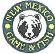
Exhibit C SPEAKER'S CARD New Mexico State Game Commission Meeting

(Please Place Form in Appropriate Agenda Slot)