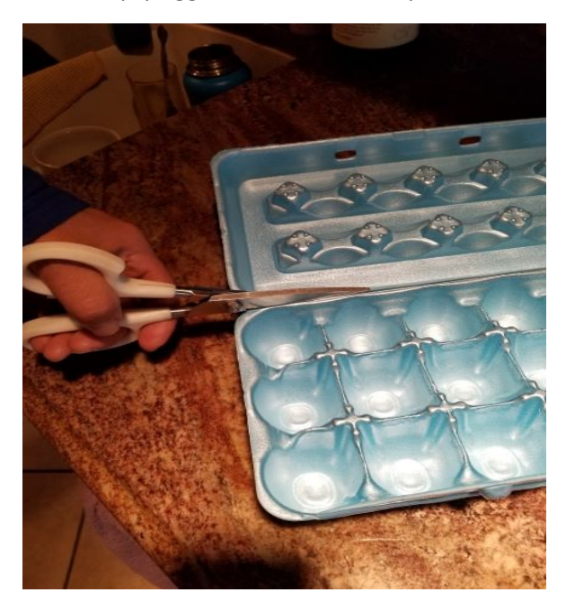
Step # 2 – Cut the egg carton in half, this helps with stability.

Step # 1- Take an empty egg carton and carefully cut it in half. Trim all edges off.