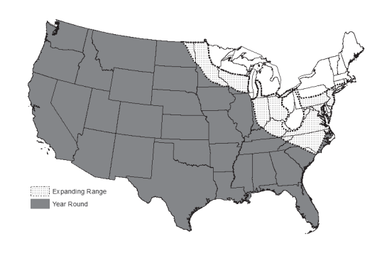
Range in the Lower 48 States of the U.S.

NOTE: Please do not report harvest of Eurasian collared-doves to USFWS. We do not monitor harvest of this non-native bird species.