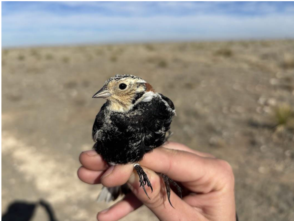
Figure 1. An adult male Chestnut-collared Longspur at Milnesand Prairie Preserve.