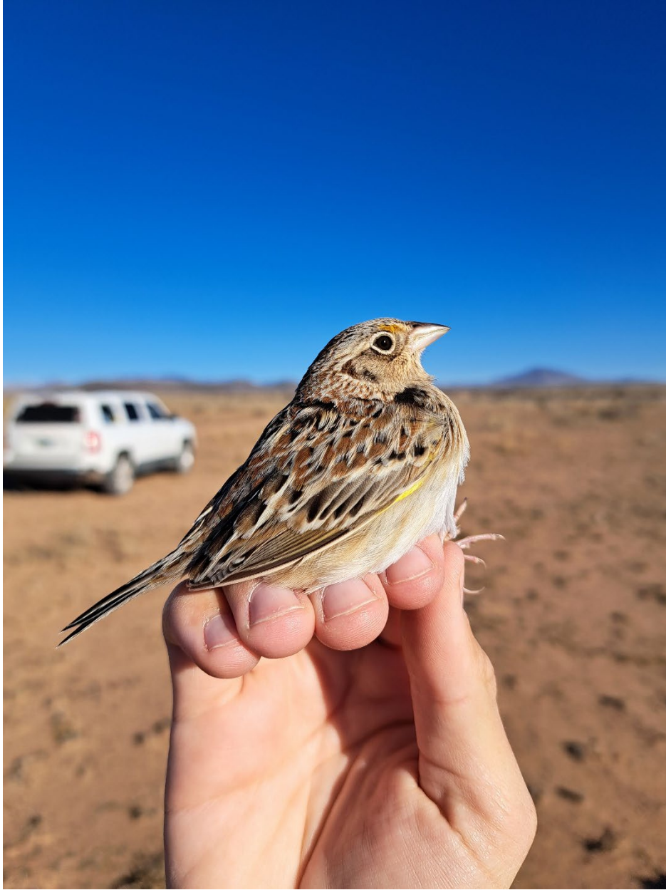
Figure 2. An adult Grasshopper Sparrow.