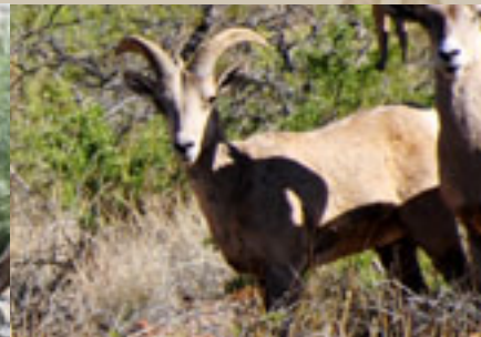
Three Young Rams