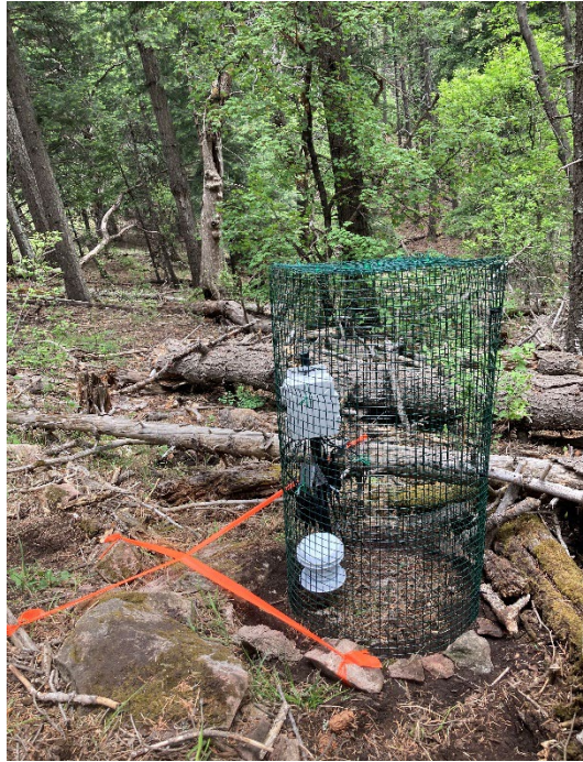
Figure 2. HOBO weather station monitoring environmental variables in a Sacramento Mountain salamander ( A. hardii ) demography plot. Orange flagging indicates the location of an instrumented rock.

During bi-weekly visits to demography plots, the entire area of each plot was scanned for PIT-tagged salamanders using a PIT tag reader (Biomark HPR Plus) and antenna (Biomark BP Plus). The antenna permits detection of tagged salamanders beneath rocks, logs, and other cover objects and up to about 25 cm below ground (Figure 3). Upon detection of a PIT-tagged salamander, the reader emits a beep and the unique PIT tag code of the salamander is displayed on the screen. For salamander detections using the antenna, we recorded geographic coordinates at the point of detection and the cover object type associated with the detection.