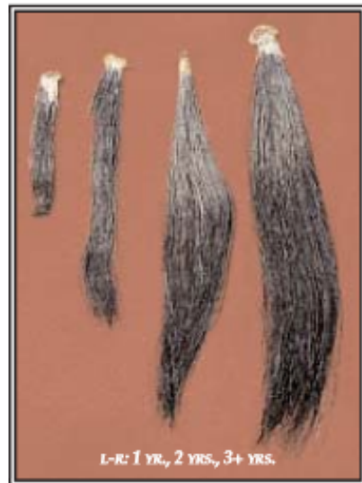
L-R: 1 yr., 2 yrs., 3+ yrs.