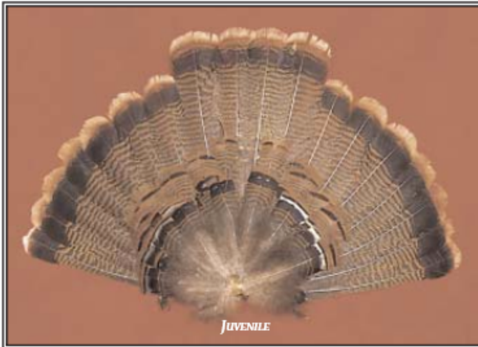
Juvenile – irregular contour of tail feathers