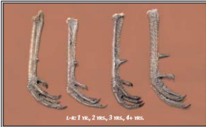
L-R: 1 yr., 2 yrs., 3 yrs., 4+ yrs.