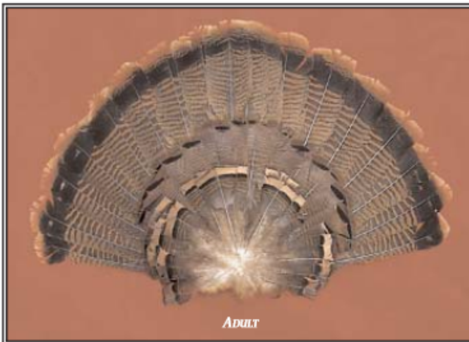
Adult – regular contour of tail feathers