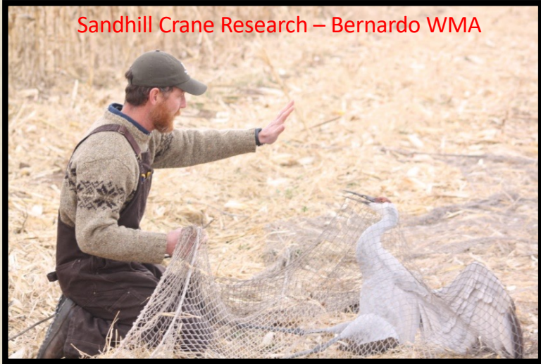
Sandhill Crane Research – Bernardo WMA