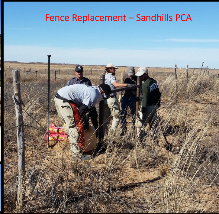
Fence Replacement – Sandhills PCA