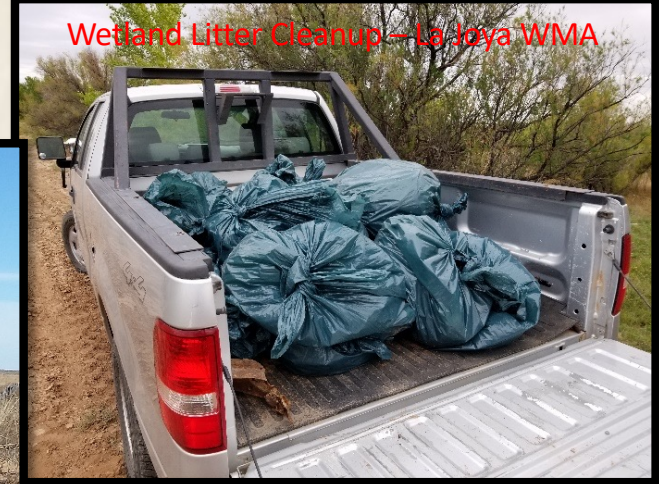
Wetland Litter Cleanup – La Jota WMA