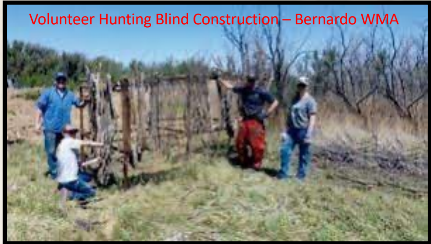
Volunteer Hunting Blind Construction – Bernardo WMA