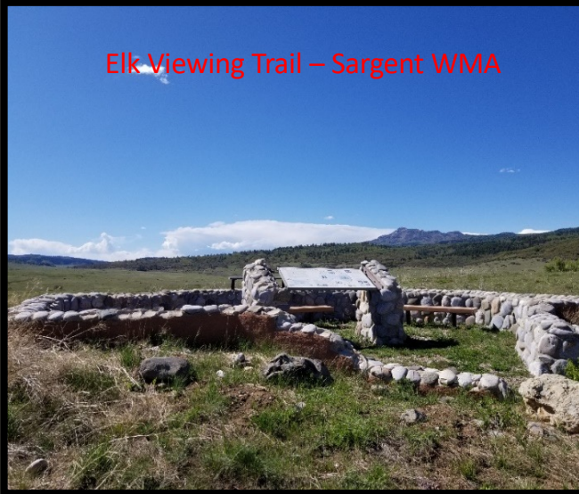
Elk Viewing Trail – Sargent WMA