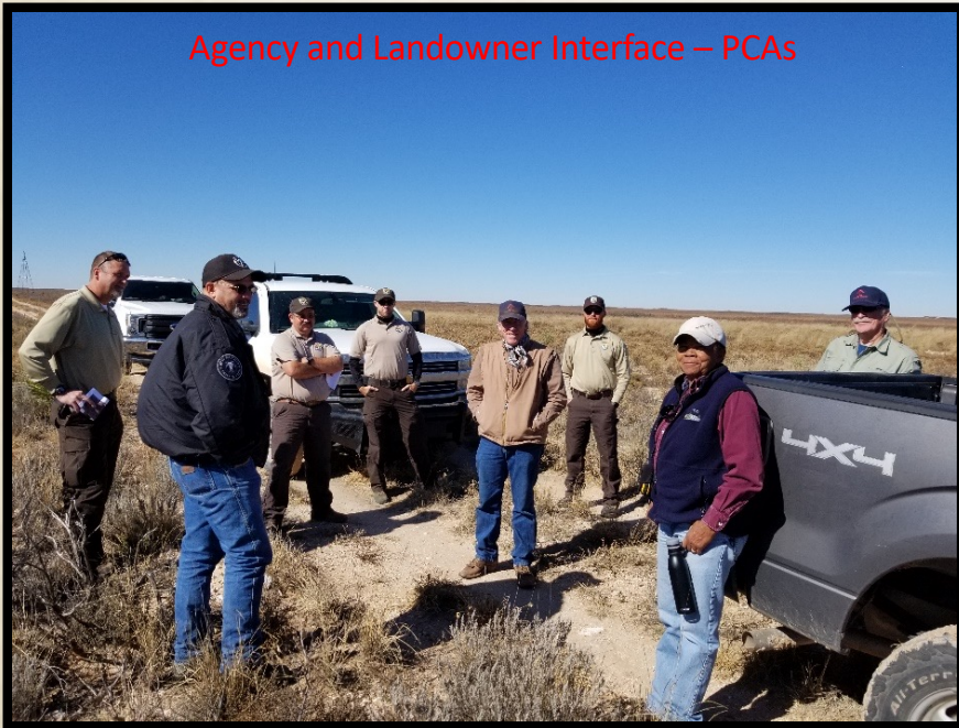
Agency and Landowner Interface – PCAs