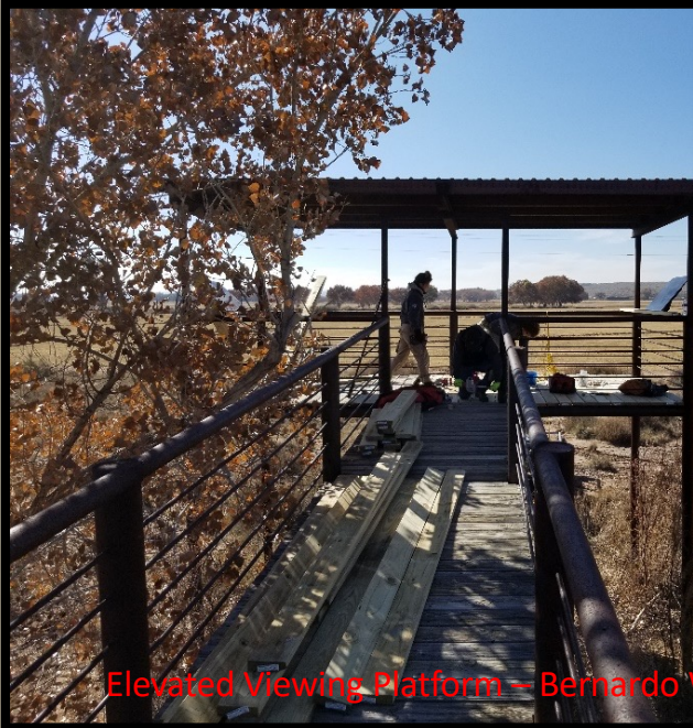
Elevated Viewing Platform – Bernardo WMA