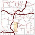
White Sands Missile Range & San Andres NWR in New Mexico

Universal Transverse Mercator Projection, Zone 13 1983 North American Datum Geodetic Reference System 1980 Spheroid