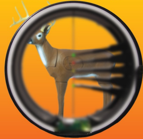
Verifier Power Correct Clear Target / Clear Pins