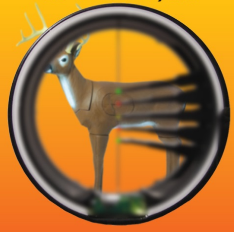
Verifier Power Correct Clear Target / Clear Pins