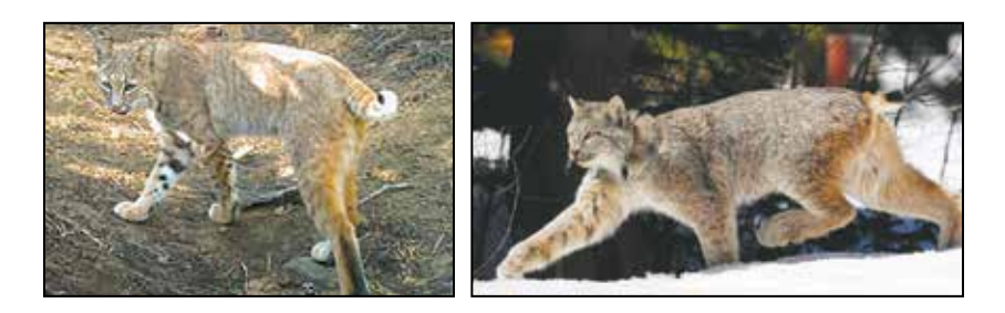
Left: Bobcat. Right: Lynx.

There is no open season for Canada lynx in New Mexico. Any lynx caught while trapping in New Mexico must be released alive, and the incident must be reported to NMDGF within 24 hours. If you are not certain whether you have caught a bobcat or a lynx, please contact your local conservation officer or the NMDGF Furbearer Program: 505-257-8701 .