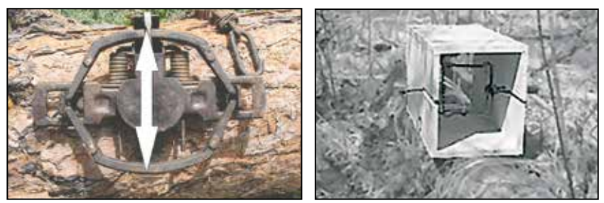
Left: Foothold trap jaw spread. Right: Recessed cubby.